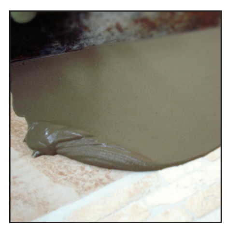
PRO PATCH SUPREME™ used as an embossing leveler over existing ceramic tile