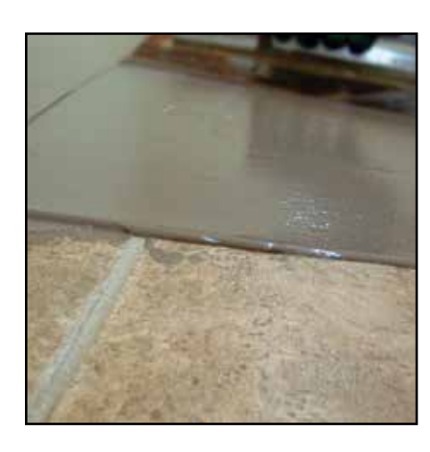
PRO PATCH™ mixed with PRO PATCH LIQUID™ used over non-cushioned vinyl sheet goods as an embossing leveler