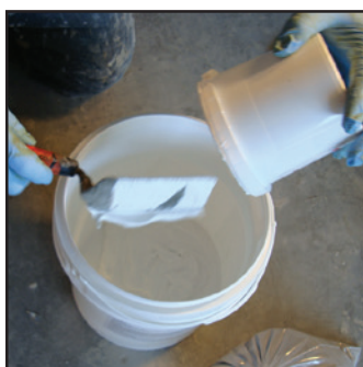
Mixing Pail, Part A (resin)