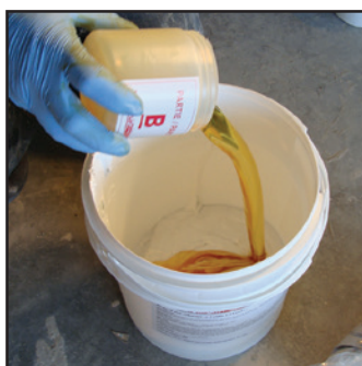
Mixing Pail, Part B (hardener)