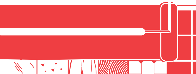
Metal Concrete Exterior-Grade Plywood Cutback Adhesive Residue Existing VAT, VCT, and Non-Cushioned Vinyl Sheet Goods Existing Tile

* Provided that the tensile bond strength of 72 psi (0.5 MPa) is reached as a minimum for self-leveling applications