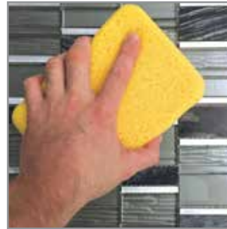
Slightly moisten tile surface with a damp sponge just before application to help with spreading the grout. Note: Working time and ease-in-cleanup can be dramatically extended (for up to 2 hours) when using PROMA's PRO GROUT™ EASE.