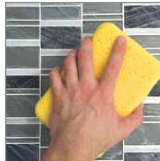
Clean the sponge, and then while slightly damp (not wet), gently wipe excess material from the surface using light and delicate diagonal passes. Change water and rinse the sponge frequently. Keeping the water and sponge clean will achieve better joint color uniformity.