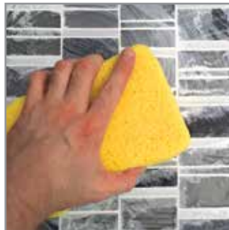
Allow grout to harden for about 20 to 30 minutes. Using a slightly dampened cellulose sponge, loosen up all excess grout over the tile with a circular motion. Do not add water before all is well loosened up.