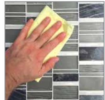
Wait at least 15-30 minutes before removing the final haze from the tile or stone surface with a slightly dampened white scrubbing pad or a microfiber towel.