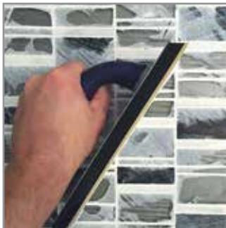
Remove excess grout through successive diagonal passes using the edge of the rubber float held at a sharp 90° angle.