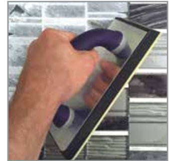
With a firm to medium sharp-edged rubber float, force grout diagonally into the joint at a 45° angle, ensuring that the grout is well-compacted, free of voids and pin holes, and filled flush with the tile or stone edge.