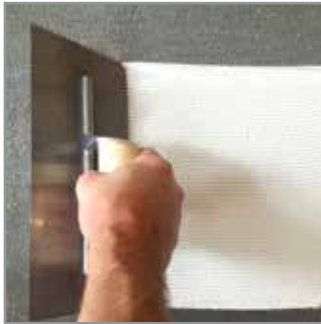
Apply an adhesive layer using the notched side of the trowel ridge in a straight-line directional pattern to achieve an even spread. For walls, maintain ridges running in a horizontal directional pattern.