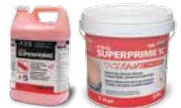
Cured concrete (28 days) Metal such as steel, copper, stainless steel, aluminum or lead Exterior-grade plywood Existing ceramic and quarry tiles, porcelain, granite and marble Existing VAT, VCT, non-cushioned vinyl sheet goods, homogeneous PVC flooring Adhesive residue Painted substrates

PROMA has engineered a revolutionary primer that can ready nearly any surface for PROMA leveling underlayments without the need for scarifying or Use PRO SUPERPRIME™ or PRO SUPERPRIME 1C™ with PRO FLOWLEVEL 40 as an unbeatable system for preparing a substrate for flooring installation. meet a minimum of 0.5 MPa (72 psi) tensile bond strength. In areas subject to heavy traffic, a minimum of 1.2 MPa (175 psi) tensile bond strength is required technical data sheet for details).